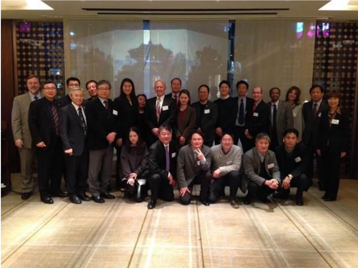
The American Plywood Association brought members of the U.S. glulam and plywood industry to Seoul to meet with local buyers and distributors, seeking to address upcoming new regulations in the Republic of Korea that could negatively impact trade.