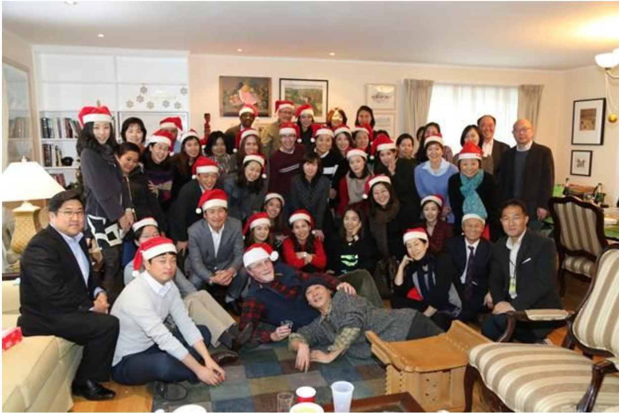
For a fun event, the staffs of the Agricultural Affairs Office, the ATO, APHIS and members of the local cooperator community joined last December to celebrate the holidays.